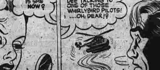
BY PETE HOFFMAN