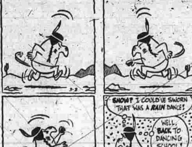
BY FRANK O'NEAL