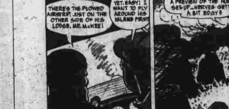
BY PETE HOFFMAN