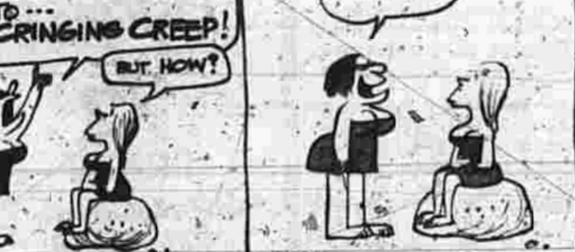
BY JOHNNY HART